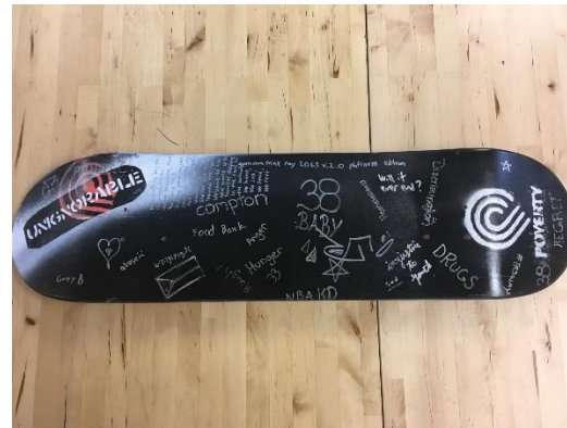
Make Your Mark Sharpie Boards

The weekly visits allowed for conversations to be had between youth while creating some wonderful art. The first visit enabled the students and youth to get introduced to one another, to have all involved be given a synopsis of the project and use the button maker to make buttons. Students brought along Sculpey® clay to create sculptures on the second visit and the third week participants created drawings using pencils and paper. Each visit SPO students heard stories from the co-op youth as to what it takes to survive and live on the street. It was these stories that SPO student Becca described as "an