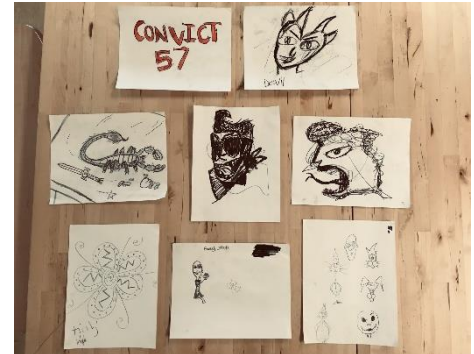
Art pieces created by SPO students and OSYS youth during the weekly visits.

Using these emotions, stories and experiences the SPO students then embarked on their skateboard deck design planning and implementation. Each student was given a blank skateboard deck and were challenged to create a graphic that promotes an awareness of poverty and homelessness in youth. One goal was to create a graphic that encourages a discussion around this issue and maybe be an impetus for change. These boards were to be displayed in an art show and silent auction fundraiser for the OSYS on the evening of February 19 at The Aviary in the heart of Edmonton.