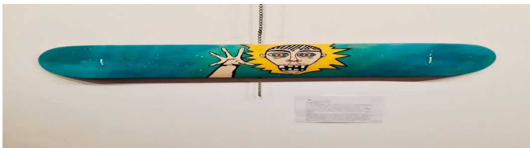
Untitled skateboard by SPO student Emily K.