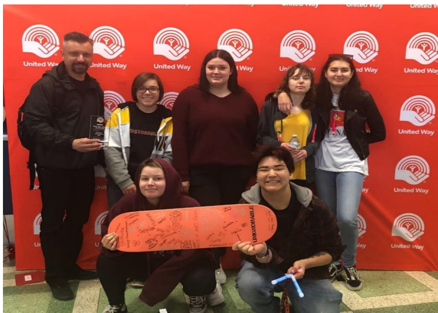
Next Step High School students celebrating their Awareness Award

On April 29th the United Way hosted an awards program and celebration where more than 300 students, teachers and guests attended. It was a chance for everyone involved in this initiative to see all of the twenty-one projects and the impact they had on fighting poverty. Four projects were put in the spotlight for their efforts and the students from Next Step High walked away with an Awareness Award for their project. This award highlighted the hard work these students did and recognized the impact it had on everyone involved.