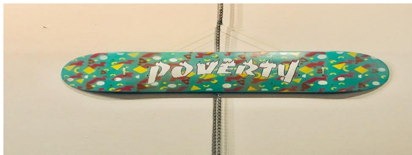
Skateboard entitled “Time Machine” by SPO student Max T.

Using these emotions, stories and experiences the SPO students then embarked on their skateboard deck design planning and implementation. Each student was given a blank skateboard deck and were challenged to create a graphic that promotes an awareness of poverty and homelessness in youth. One goal was to create a graphic that encourages a discussion around this issue and maybe be an impetus for change. These boards were to be displayed in an art show and silent auction fundraiser for the OSYS on the evening of February 19 at The Aviary in the heart of Edmonton.