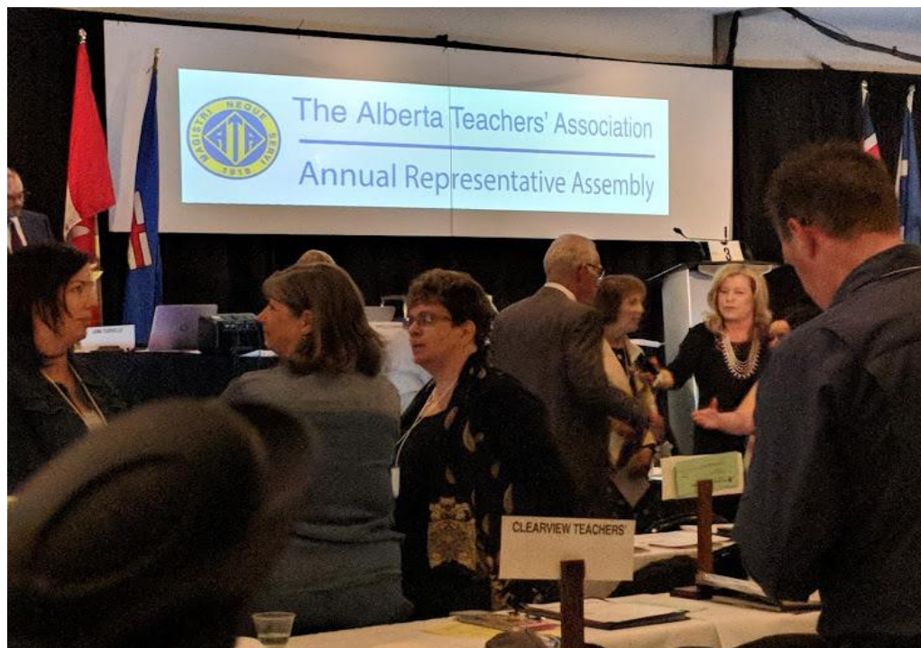
NINE DELEGATES FROM LOCAL 28 ATTENDED THE 2019 ARA ON MAY 18-20 – ARTICLE P.13